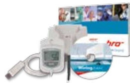
EBI 20-TF-Set Temperature logger set (logger with external probe up to +100 °C (+212 °F), evaluation software, interface)