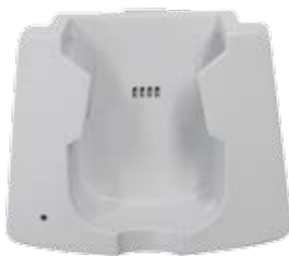
EBI 20-IF Interface