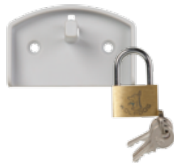
EBI 20-WM wall bracket