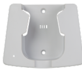
EBI 20-WM-1 truck wall bracket