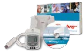
EBI 20-TH1-Set Temperature Humidity Logger Set (Logger, Evaluation software, Interface)