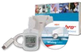
EBI 20-T1-Set Temperature logger set (temperature logger, evaluation software, interface)